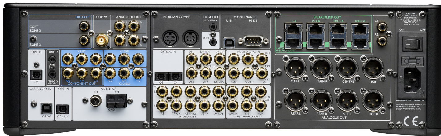
G68 rear panel layout

quality digital filters that smooth out the reverberation time at resonant frequencies to a value similar to the overall reverberation time of the room. This is an extremely benign way to approach the problem, and it produces audible results, cleaning up muddiness and making the position of instruments in the soundstage easier to discern. The overall sound is tighter, clearer and easier to listen to.