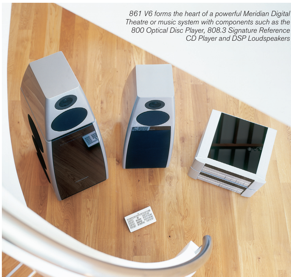
861 V6 forms the heart of a powerful Meridian Digital Theatre or music system with components such as the 800 Optical Disc Player, 808.3 Signature Reference CD Player and DSP Loudspeakers

software for the format, speaker layout and encoding of the incoming signal. You can also store separate user parameters for each source (such as DVD) depending on whether the incoming signal is stereo or surround.